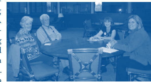
HHRF representatives at the Fieldstone Farm Therapeutic Riding Center reception in September.

HHRF was selected by Averett University as the beneficiary of their upcoming event "Around the World in 80 Days: A Celebration of Dancing Horses to Music from Film and Stage, Representing the Cultures and Stories from Around the Globe." The event will take place on April 15th-17th 2011, in Danville, VA. Half of all proceeds will be donated to HHRF. For more details, please visit horsesandhumans.org .