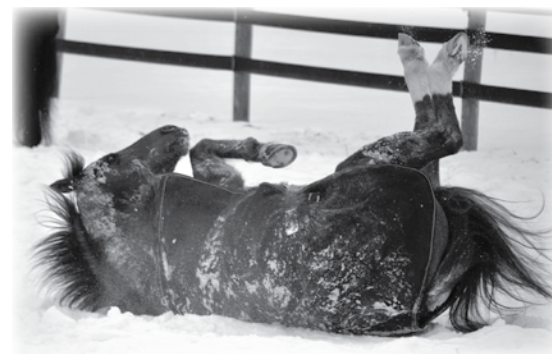
Our visionary donors make us feel like rolling for joy too! Above is Fieldstone Farm TRC (Ohio) therapy horse "Dodge".